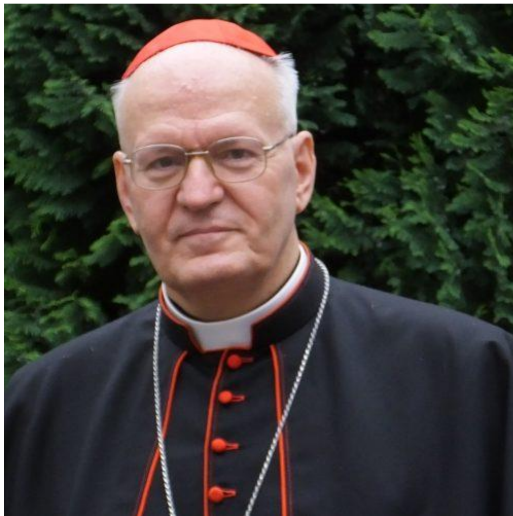
S.Em.R. Peter Card. Erdő

Primate of Hungary, Archbishop of Esztergom-Budapest. Judge of Signatura Apostolica, member of The Congregation for Catholic Education, member of the Congregation for Divine Worship and the Discipline of the Sacraments and member of the Pontifical Council for Legislative Texts. President of the Hungarian Catholic Bishops' Conference, Grand Chancellor of the Péter Pázmány Catholic University (2005-2015) and President of the Council of Bishops' Conferences in Europe (2006-2016). Member of the Hungarian Academy of Sciences (2013–). Motto: Initio non erat nisi gratia - In the beginning there was nothing but grace.